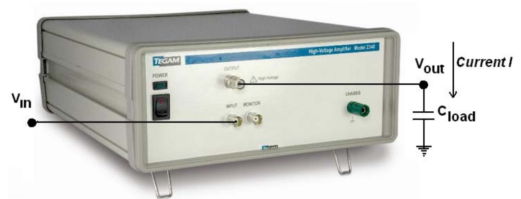
Figure 4 - A capacitive load at the output of the voltage amplifier can change its slew rate.

From the equations above, we can notice that increase in the capacitance value lowers the reactance and increases the current requirement for a constant voltage and frequency value.