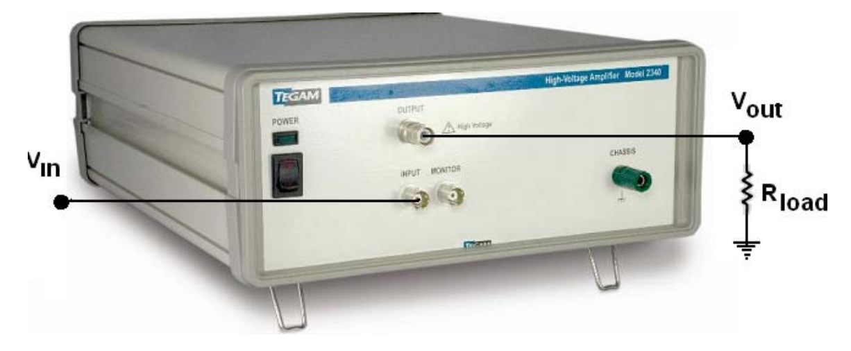
Figure 3 - A resistive load at the output of the voltage amplifier.

Figure 3 shows an actual amplifier with a resistive load.